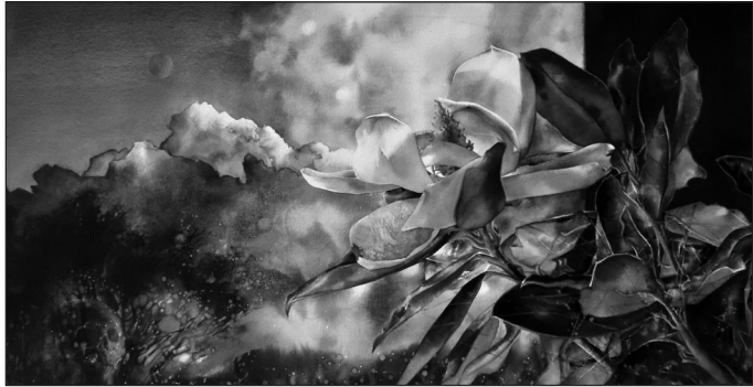
Image Credit: "Blood Moon", Brent Funderburk, watercolor on paper, 2020, 21" x 41". From the series "Re-Inflorescence", collection of Tibor and Olga Pechan.