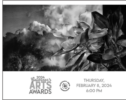
Printed materials designed by Lucy Hetrick